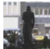
Statue Number, 2010, Moon

<Media Landscape, Zone East> features a group of artists working internationally who focus on 'moving images', showcasing newly released works that use a variety of media and methods reflecting their reinterpretation of new media art.