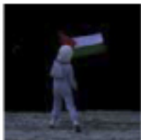
A Space Evolve, 2009, Lina Selander

Future Movements features artworks that draw inspiration from the city of Jerusalem and its changing urban structure. The exhibition takes the viewer to places outside the spiritual and holy Old City to urban locations that, despite their importance in shaping the contemporary urban city, have rarely been referenced or addressed in literature and visual art.